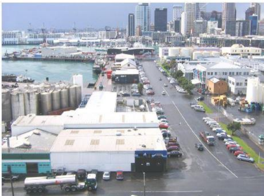
Before – Circa 2008