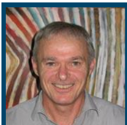
Department of Conservation