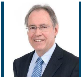
NZ Transport Agency Chair