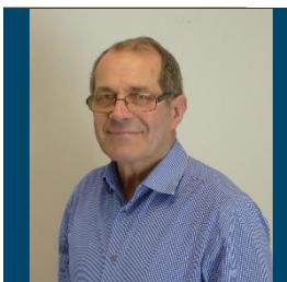
Local Government NZ Co-Chair