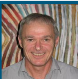
Department of Conservation