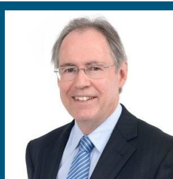
NZ Transport Agency Co-Chair