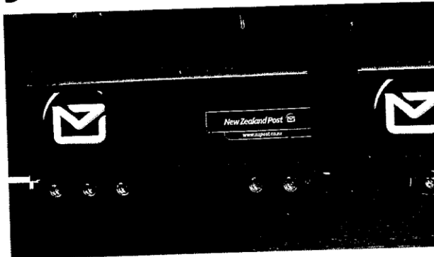
Michael Pickford's DAF is designed to meet 50MAX requirements.

Well at last we have the start date for the introduction of the new configuration for 50MAX vehicles on our roads. But there is still a whole lot of work that needs to be done before this is a really happening thing.