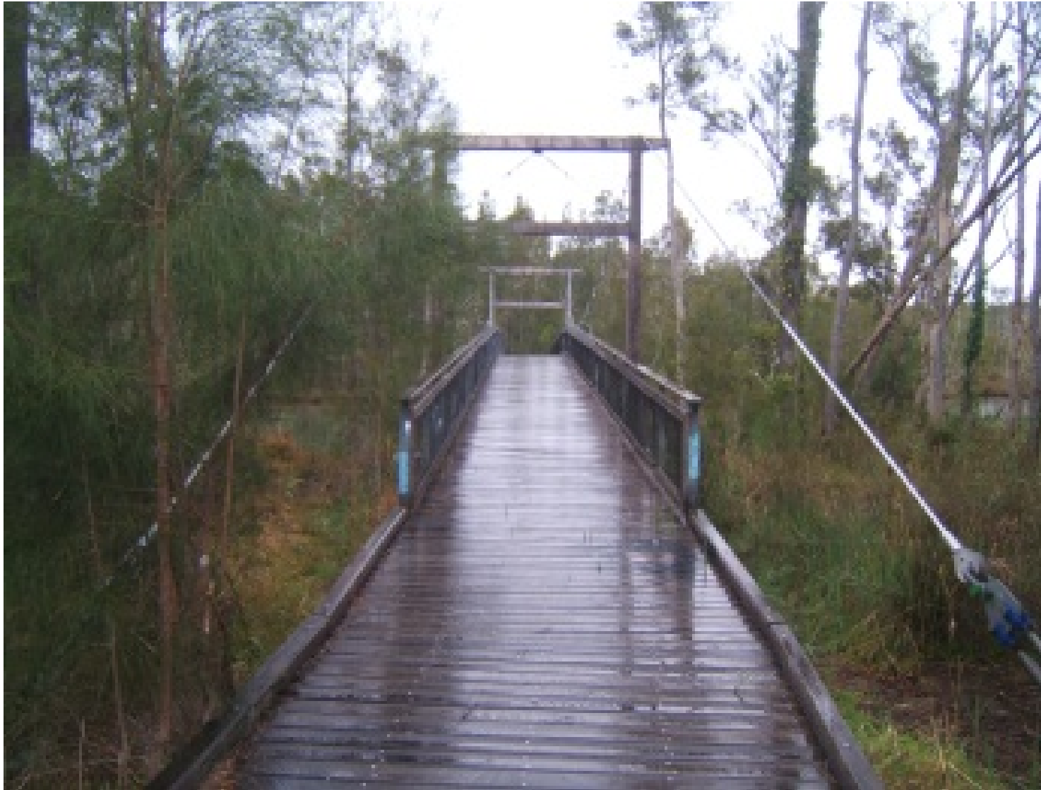
Chain Valley Bay Bridge, Wyong, NSW