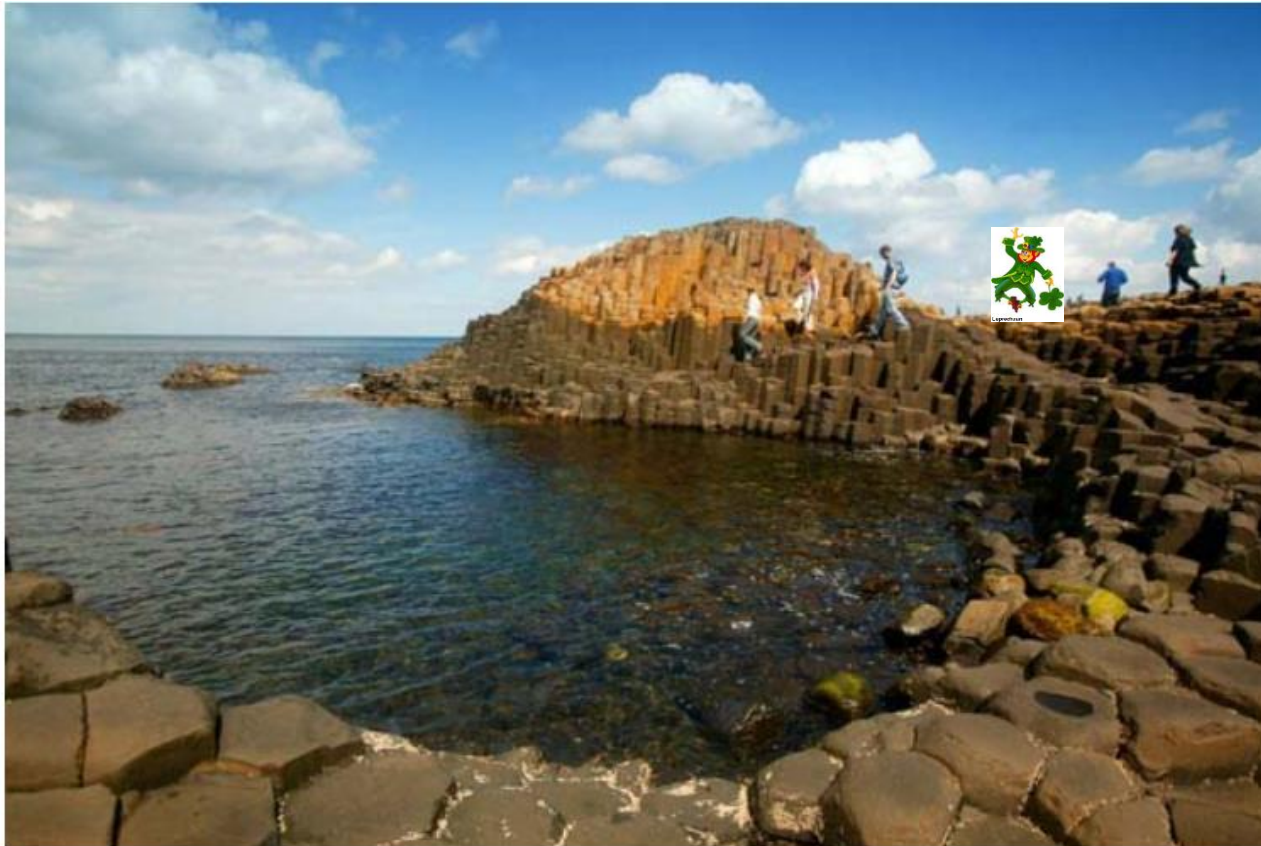
Giants Causeway Northern Ireland